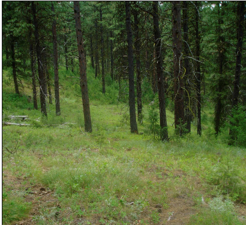
Figure 2. Mixed conifer forest with dense understory typical of survey area.