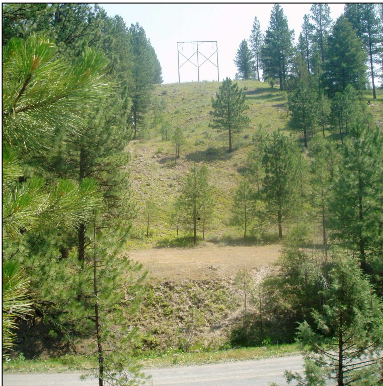
Figure 3. Powerline Corridor.